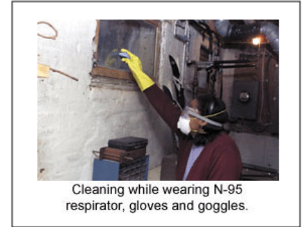
Cleaning while wearing N-95 respirator, gloves and goggles.